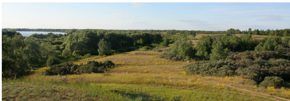
Figure 2. Steppe slopes near river Irtysh in Cherlacksy district, 2 km N of Malyi Atmos vill.