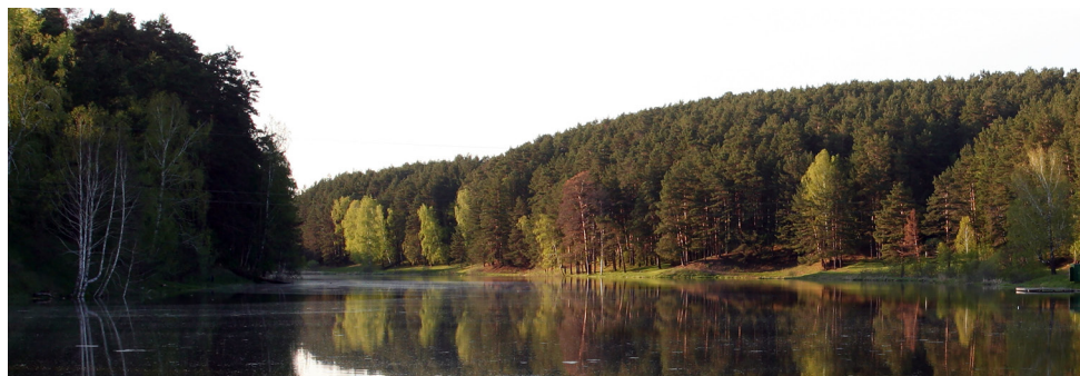
Figure 1. Pine forest in Muromtsevsky district, Petropavlovka village.

The nomenclature and order of taxa is given according to M.L. Danilevsky (Danilevsky 2021) with some changes according to A.I. Cherepanov (Cherepanov 1979, 1981, 1982, 1983, 1984, 1985) and the Catalog of the Palearctic Coleoptera (Danilevsky 2020).