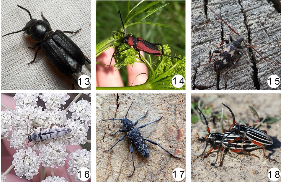
Figures 13–18. 13 – Spondilis buprestoides , Petropavlovka, at light, 24.VII.2010, photo by S.A. Knyazev; 14 – Purpuricenus globulicollis , Partsyezd, 26.VI.2021, photo by S.M. Saikina; 15 – Semanotus undatus , Podgorodka, ex larva, 22.I.2022, photo by S.A. Knyazev; 16 – Echinocerus floralis , Elita, 21.VI.2020, photo by S.M. Saikina; 17 – Xylotrechus rusticus , Partsyezd, ex larva, 22.I.2022, photo by S.A. Knyazev; 18 – Politodorcadion politum , in copula, Buzan, 26.IV.2020, photo by S.A. Knyazev.