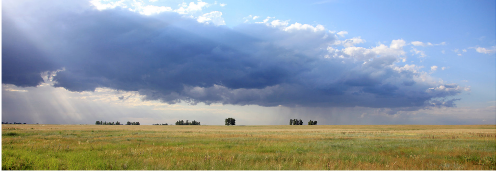
Figure 3. Steppe in Russko-Polyansky district, 2 km SE of Buzan village.