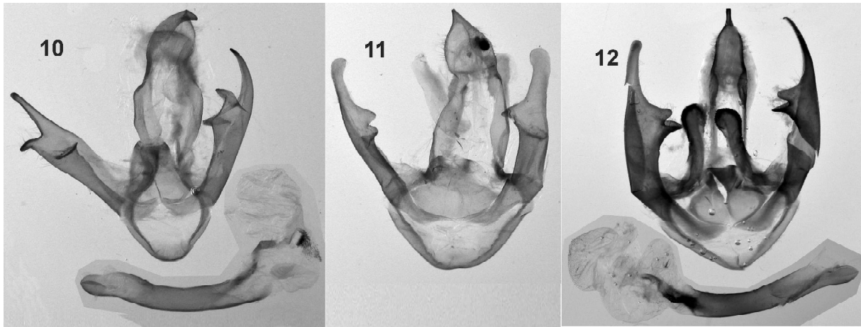
Figs 10–12. Male genitalia of the Argyartia species: 10 — A. fuscobasdalis (Matsumura), Taiwan; 11 — A. reikoae (Kishida), paratype, Taiwan; 12 — A. sericeipennis (Rothschild), Yunnan, Bingchuan.

Рис. 10–12. Гениталии самцов видов Argyartia : 10 — A. fuscobasdalis (Matsumura), Тайвань; 11 — A. reikoae (Kishida), паратип, Тайвань; 12 — A. sericeipennis (Rothschild), Юньнань, Бинчунань.