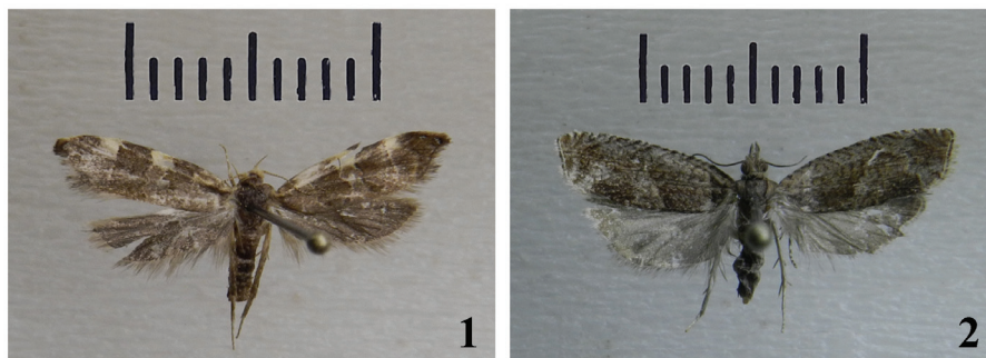
Figs 1, 2. Micromoths from Kunashir Island, dorsal view. 1 – Deuterogonia kamonjii Fujisawa, 1991, ♀ (Oecophoridae); 2 – Epinotia autumnalis Oku, 2005, ♀ (Tortricidae).

DISTRIBUTION. Russia: southern part of Khabarovskii krai (Dubatolov & Syachina, 2007), Primorskii krai (Kuznetsov, 2001), Sakhalin (Dubatolov & Titova, 2022), also China and Japan: Hokkaido (Jinbo, 2013).